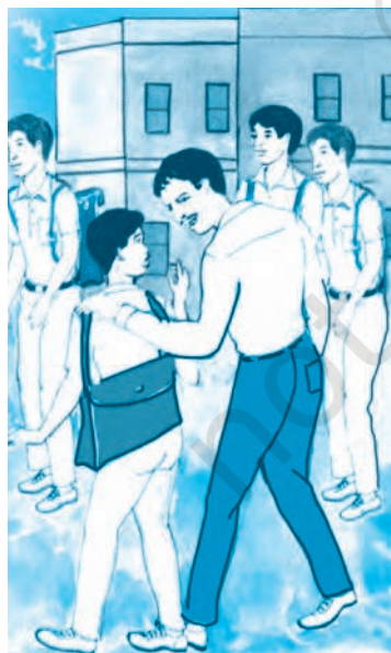
Fig. 2.2 : Parent-child Communication

Anxiety is not abnormal. Everyone gets the feeling of anxiety sometime or the other. Anxiety is an apprehension of something unpleasant or some danger. It causes mental discomfort and pain. It may sometimes prove to be useful, for example, before an examination or competition. But an abnormally high level of anxiety is counter productive as it distracts and lowers the span of attention. Adolescents sometimes panic out of anxiety without knowing the reason. They may even feel a fear of failure in future. This makes them tense and tired. Anxiety may